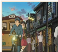
From Up On Poppy Hill