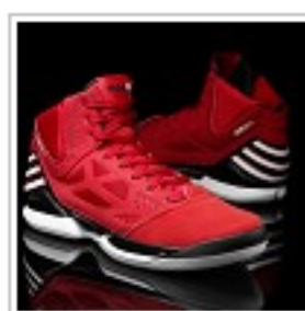
adidas adiZero Rose 2.5 'Brenda'