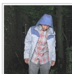
1 durkl - Think CONTRA