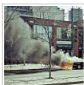
Carl_W_Heindl-04 - Think CONTRA